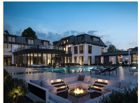
Real estate residence