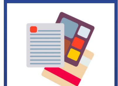
A non-judgmental document