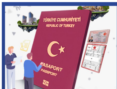
Passport or ID card