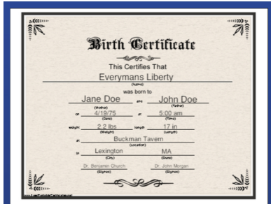
Birth certificate or civil registration release